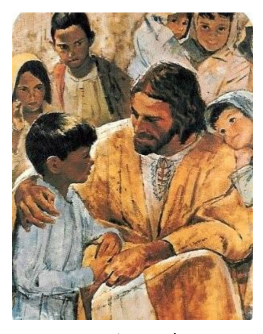
Jesus, brought us hope for forgiveness!